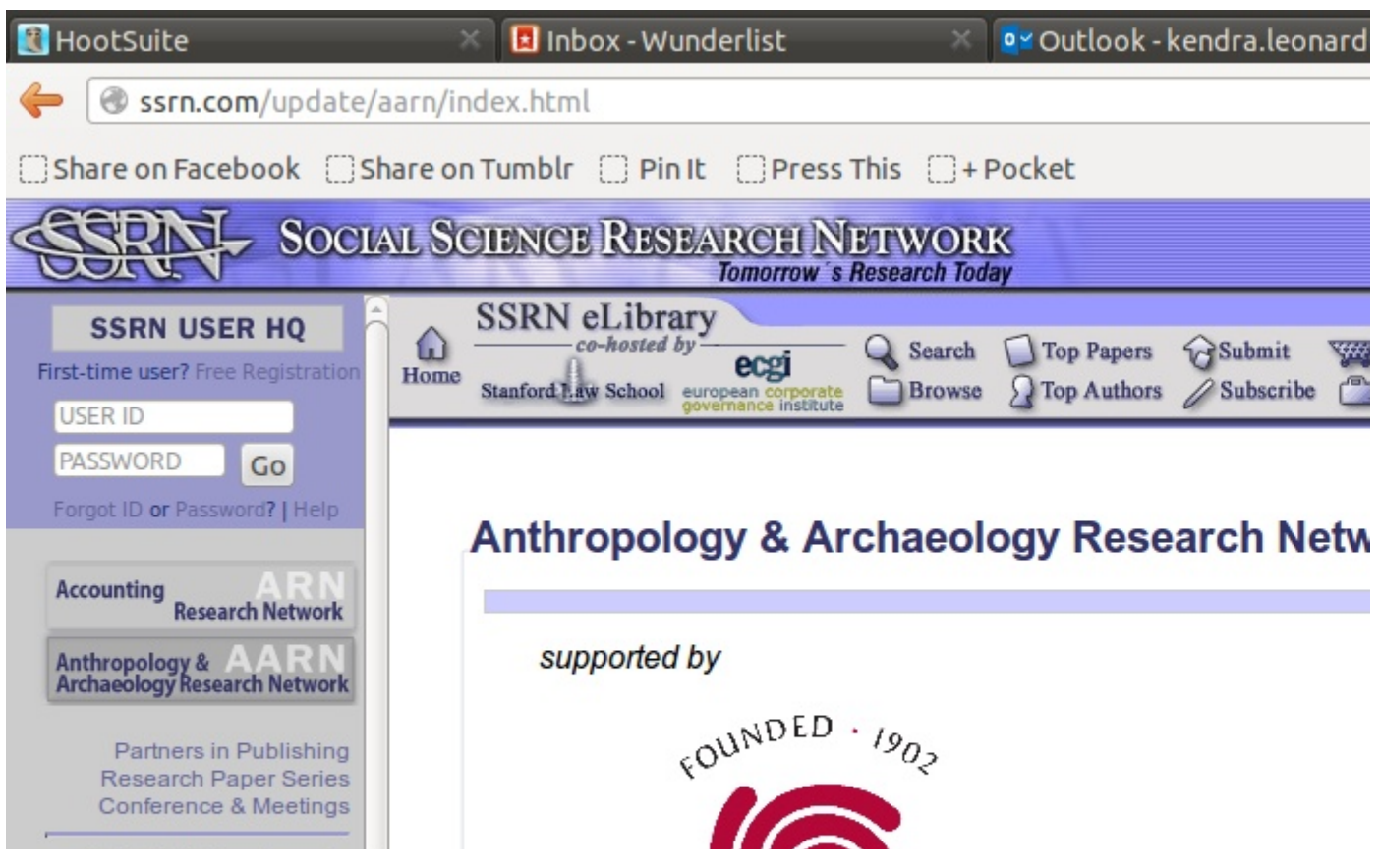
The SSRN Anthropology and Archaeology Network Page

If you work in the hard sciences, you can archive at ArXiv (arXiv.org), run by Cornell University. Authors grant ArXiv a non-exclusive and irrevocable license to distribute their article, and upload their work for free. Like SSRN, ArXiv is committed to making research available to everyone, not just to those who have a subscription or belong to an institution with a library subscription.