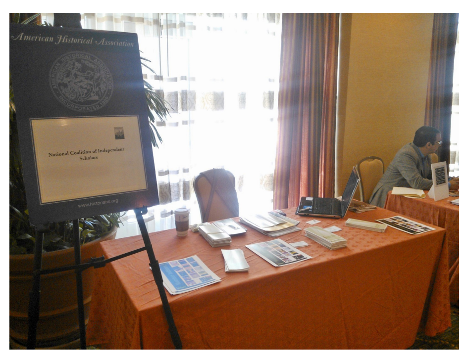
The NCIS display and information table at AHA 2013