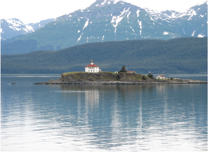
The Eldred Rock lighthouse.