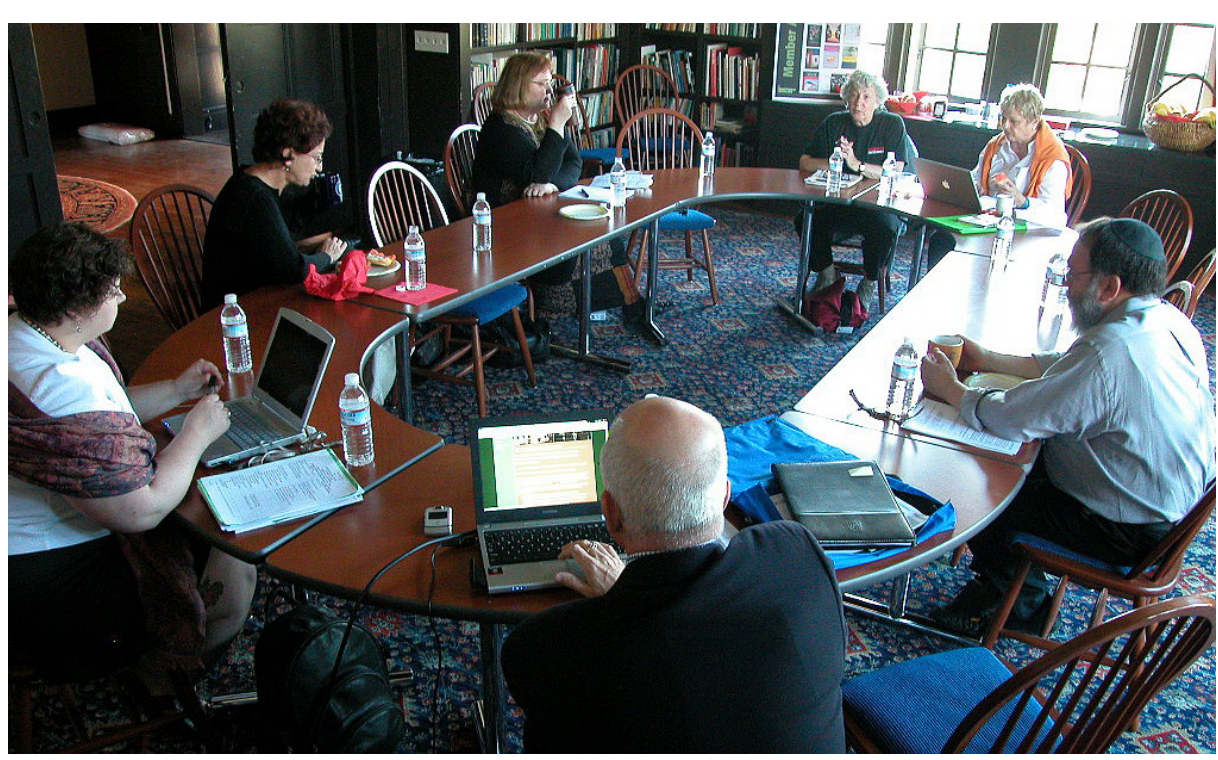
The NCIS Board meeting