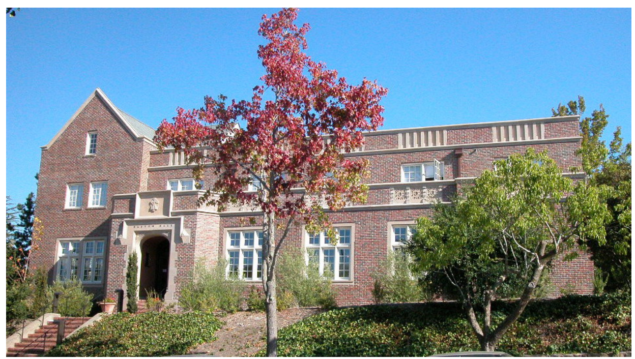
The Graduate Theological Union, UC Berkeley

The 2008 National Coalition of Independent Scholars conference and NCIS Board meeting was held on October 25 and 26, 2008, at the University of California, Berkeley.