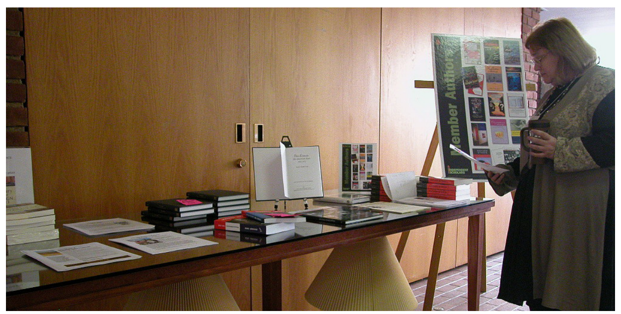
Displaying the publications of NCIS member authors