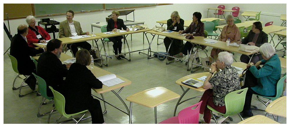
...to panels and presentations...