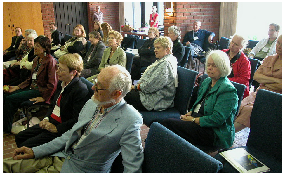
From plenary lectures...