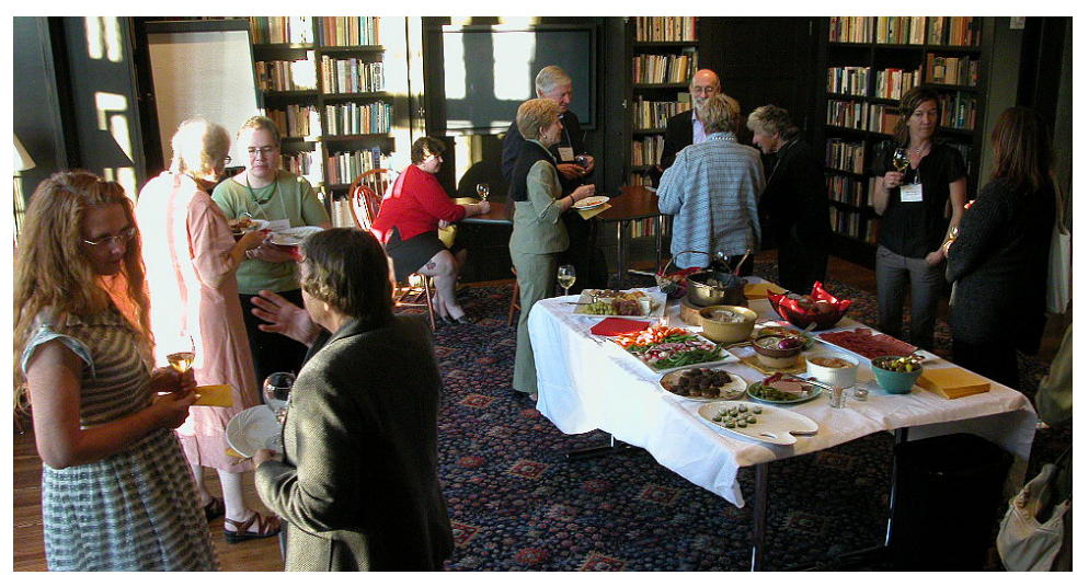
...to socializing and networking with fellow independent scholars. ❖