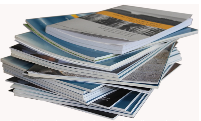
Journals are increasingly experimenting or implementing open peer review processes

The Independent Scholar Quarterly is published four times a year by the National Coalition of Independent Scholars. ©2012-15 The National Coalition of Independent Scholars. All rights reserved.