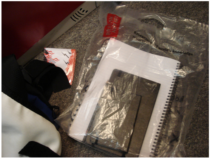
At many libraries, you must carry any belongings into the reading rooms in a clear plastic bag, like this one from the British Library.