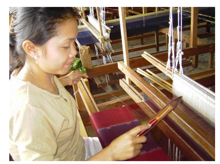
Woman Weaving Ikat, Stung Treng Women's Development Center, Cambodia.

The Independent Scholar Quarterly is published four times a year by the National Coalition of Independent Scholars. ©2012-15 The National Coalition of Independent Scholars. All rights reserved.