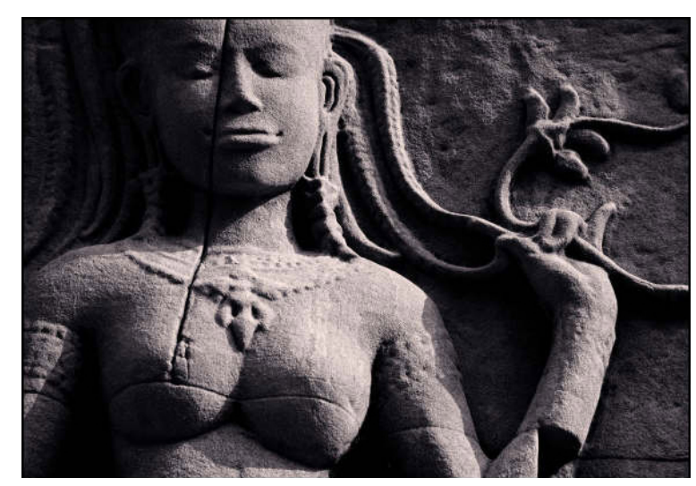
Angkor Wat Series II: "Apsara" © Tom Hricko, silver print, 1998. Used with permission.

There is no comparison. SWDC is a Khmer NGO and Cambodia remains one of the poorest