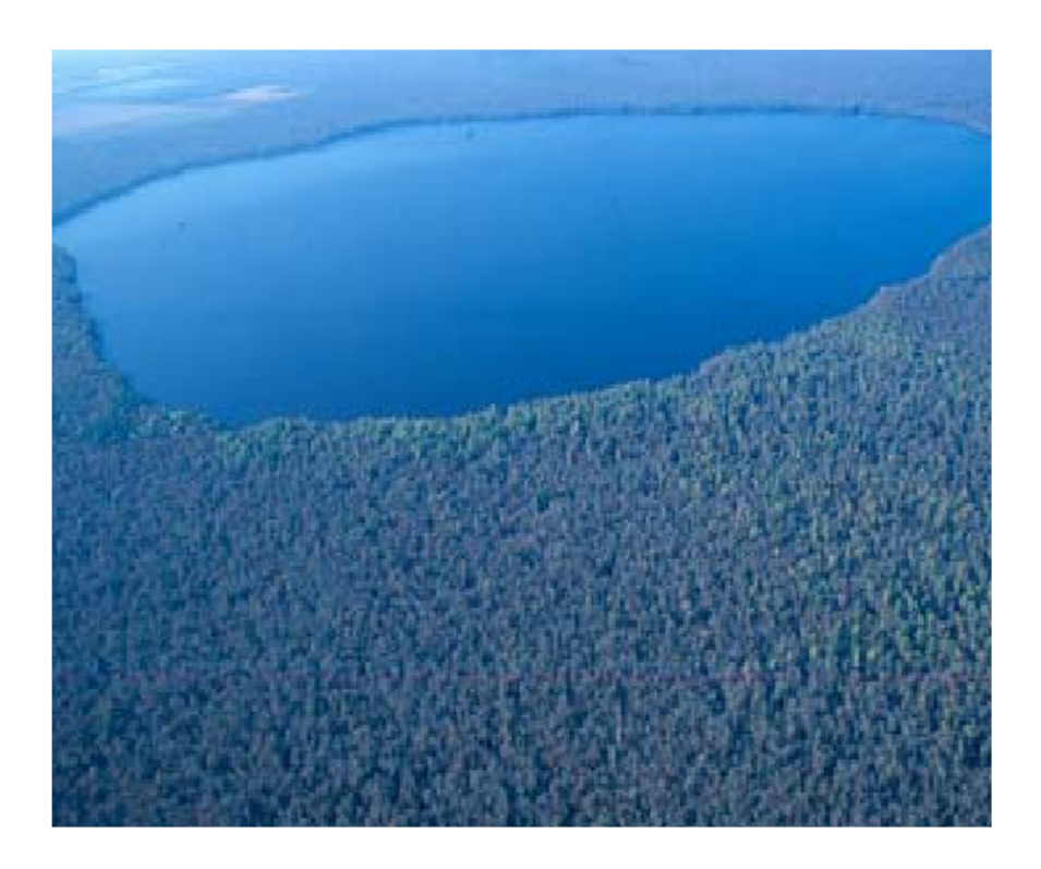
Fig 2 Aerial view of Lake Drummond at the center of the Dismal Swamp Virginia USA

This study sheds light on an aspect of United States and global environmental history seldom discussed: the environmental history, practice and values of the enslaved. Consider the worst conditions, in which enslaved peoples' survival strategies created adaptable behaviors that in turn positioned them as environmental stewards.