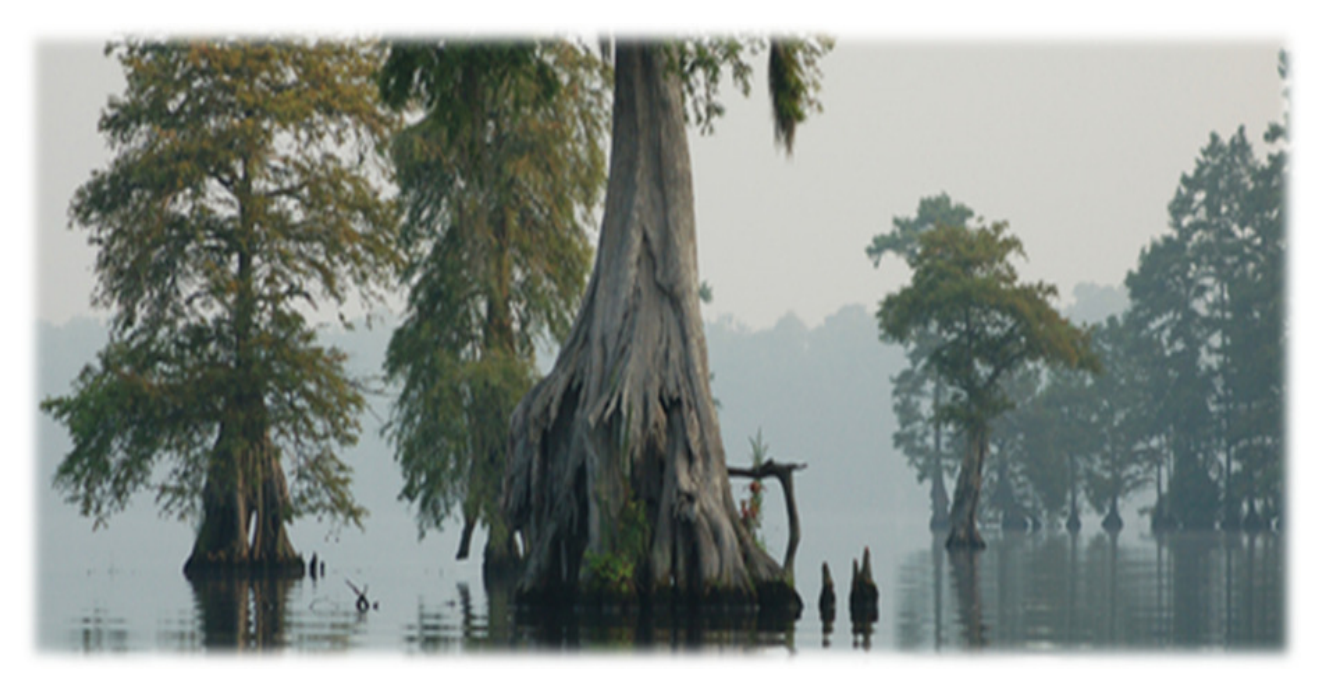
Fig 1 Lake Drummond at Great Dismal Swamp National Wildlife Refuge in Virginia.

This work is licensed under a Creative Commons Attribution 4.0 International License