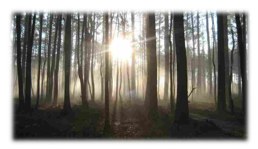
Fig 6 Great Dismal Swamp, National Wildlife Refuge, North Carolina and Virginia U.S. Fish and Wildlife Service

https://www.fws.gov/refuge/Great_Dismal_Swamp/about.html