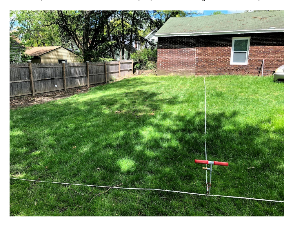
Figure 3: View of St. Oliver's Basilica site, looking north. Soil probe is located at 5 meters east of southwest corner.