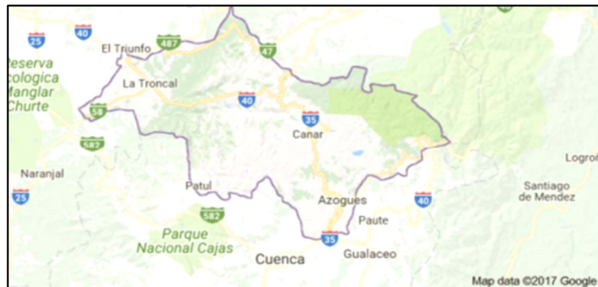
Figure 1. Map of Azogues